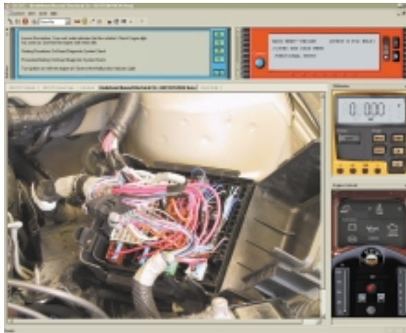
Overall VMTC Interface

Instructors can introduce engine faults in a number of ways and challenge the student to diagnose the faults on-line.