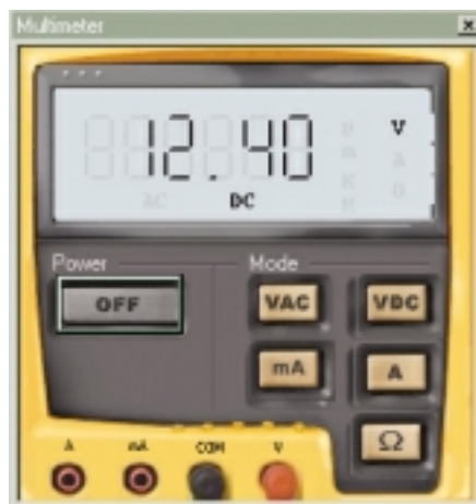
Simulated Test Equipment